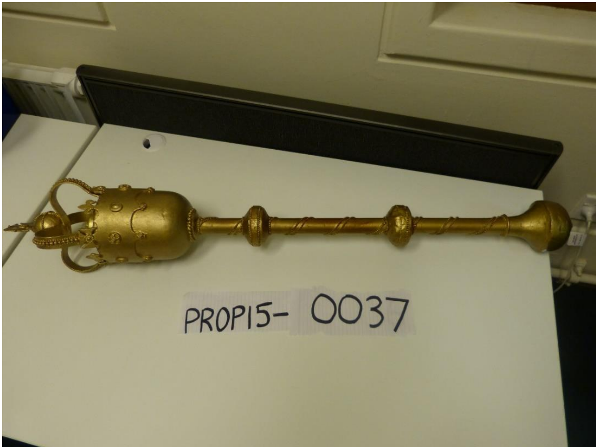
KE Emu image Prop15-0037 04-05-2015~Top.JPG

This chamber mace is wrapped in bubble wrap and is in the Learning store room. It appears to have been made from high density modelling foam, plastic sheet and plywood, covered with gold paint. A repair appears to have been to the cross on the top of the crown, which is missing. The prop number Prop15-0037 is written twice on the flat top of the crown. KE Emu image as Prop15-0037, Prop15-0037 04-05-2015~Top.JPG.