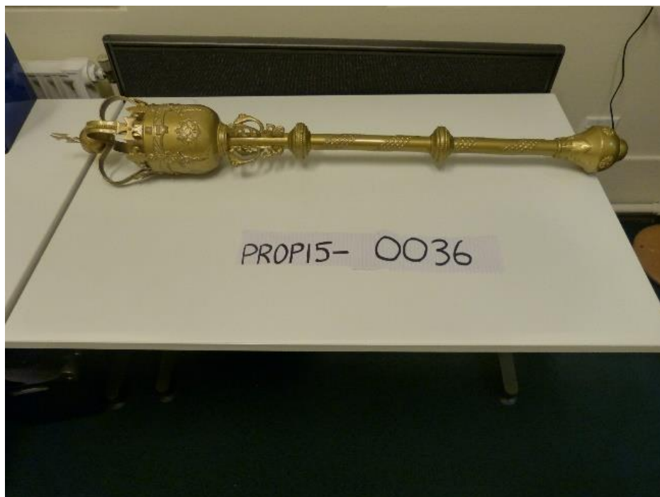
The 2008 chamber replica, registered in 2015.

According to a Learning Facilitator who started with the Learning team in 2011, an additional 'foam' replica mace was also sourced sometime around 2010 or 2011 as the 2008 replica had fallen on a visitor's foot causing an injury. This 'foam' replica mace apparently did not last long.