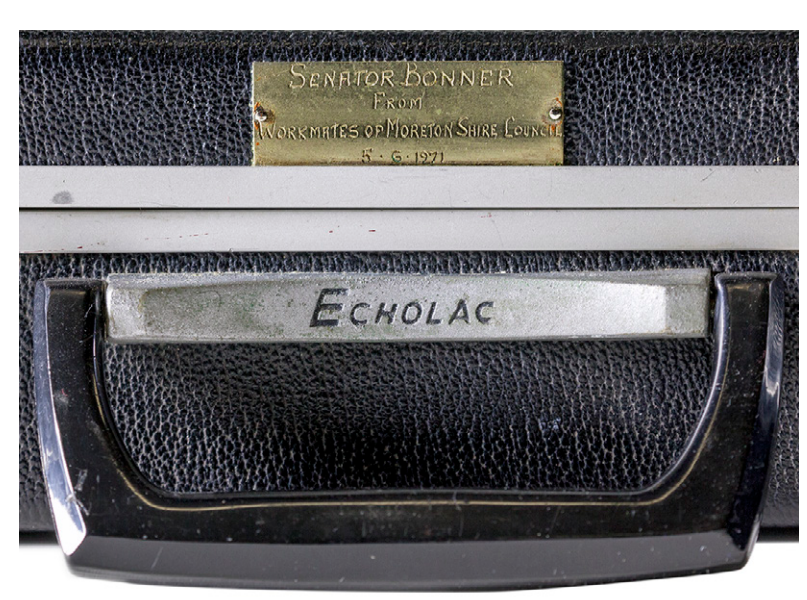
CLOCKWISE FROM TOP LEFT Items belonging to Neville Bonner Spectacles; Multi-coloured tie; Black briefcase; Black leather boots MUSEUM OF AUSTRALIAN DEMOCRACY COLLECTION